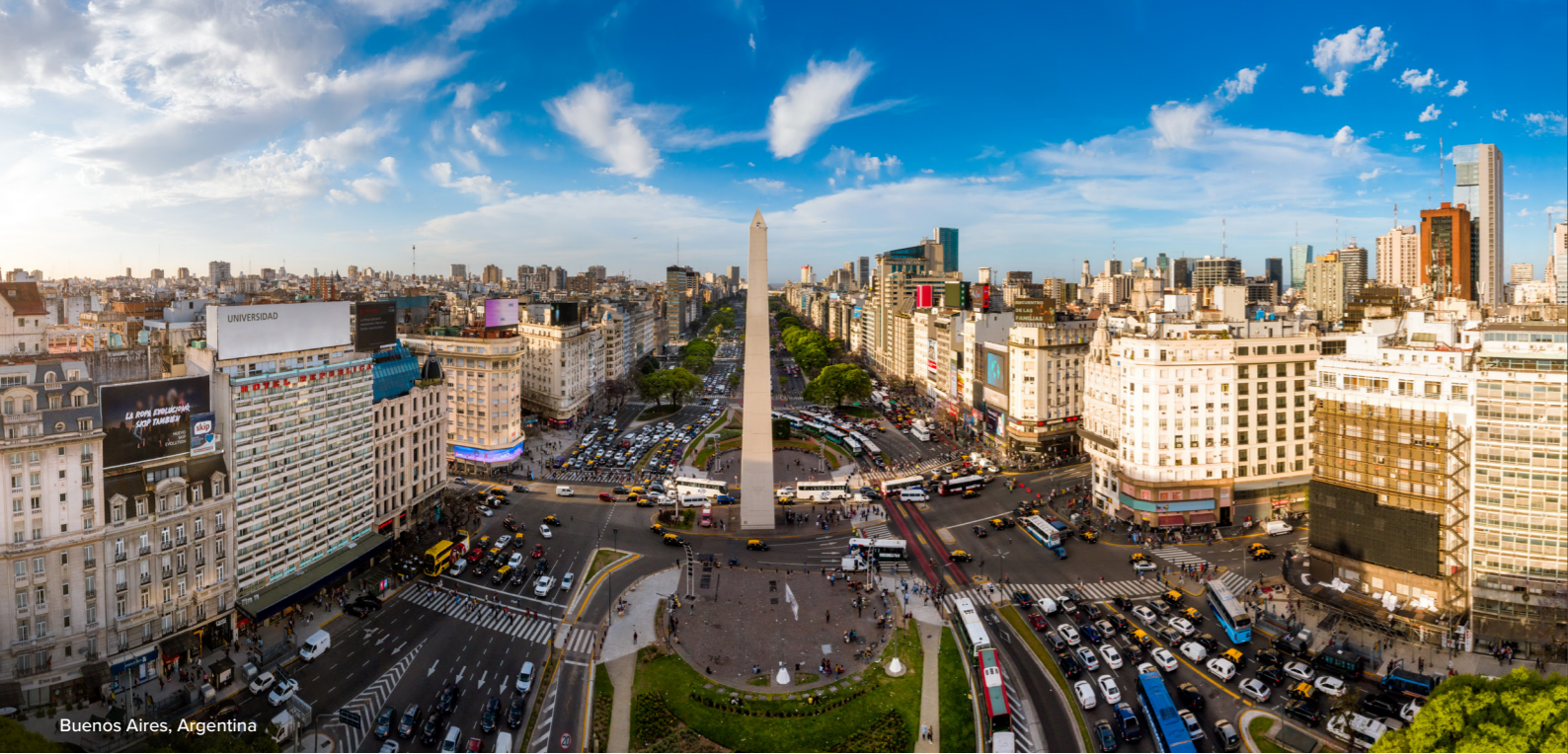
Buenos Aires, Argentina