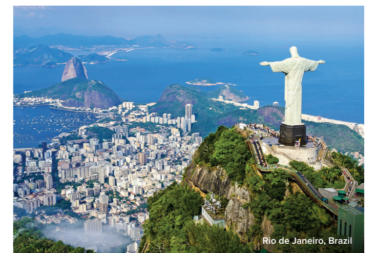
Rio de Janeiro, Brazil

Tour escort is subject to minimum numbers traveling, offers expire 31 January 2025.